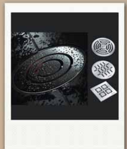
Dimensions Design Grates