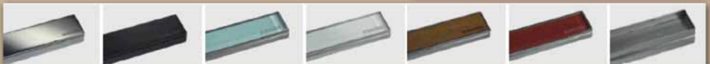
CeraLine cover plates